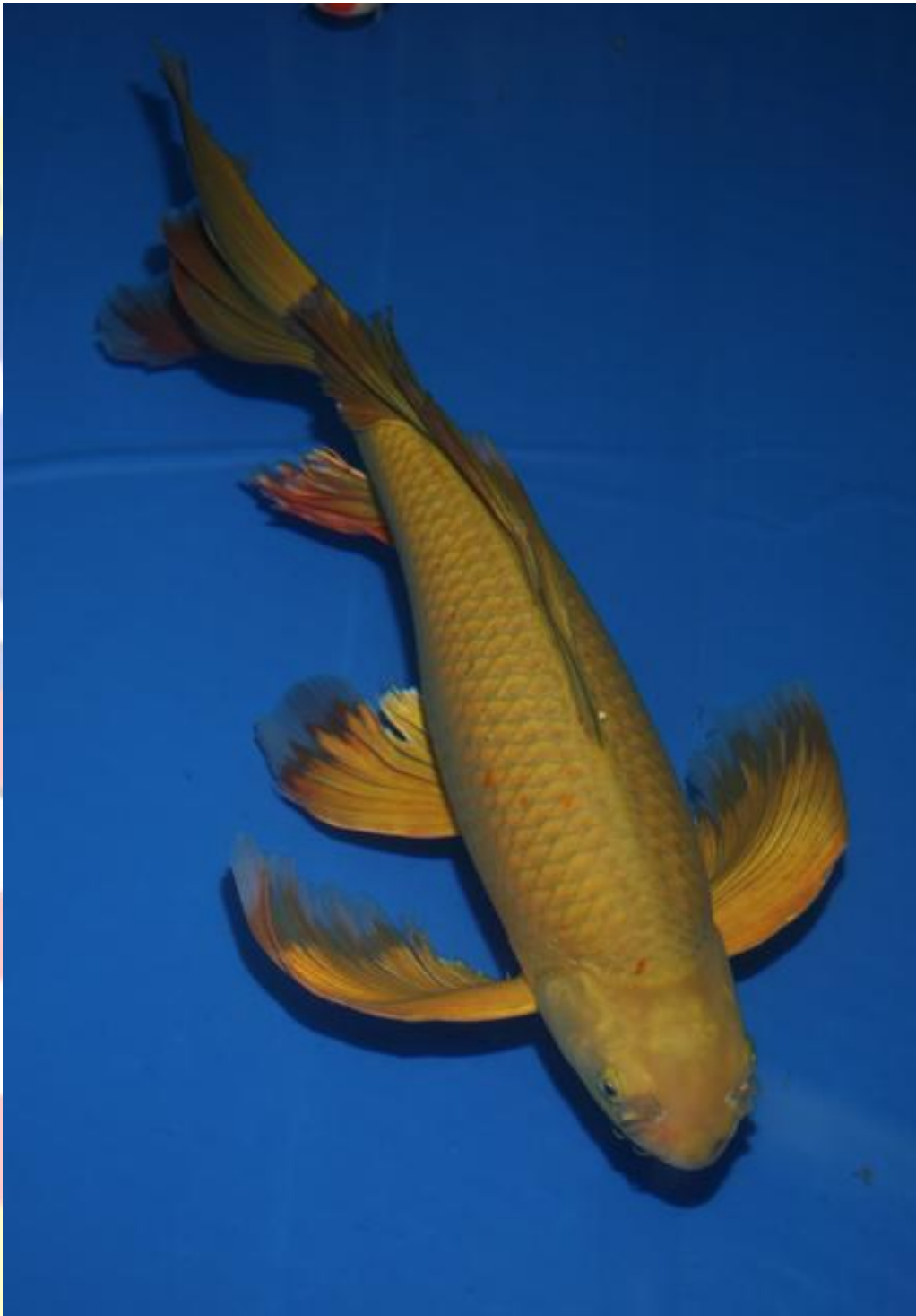
Longfin – over 16” Exhibitor: Dan Philips Sponsor: Anjon Water Garden Products