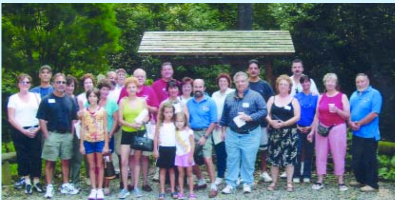
J.P. Humes Stroll Gardens

After listening to week-long weather reports forecasting hurricane winds and rains to hit Long Island, we were greeted by a beautiful morning sun! The entire day was warm and sunny – much like the environment at the homes of our gracious hosts.