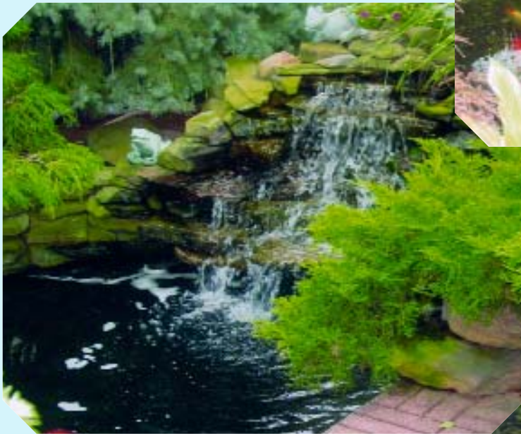
Chuck Layne's Pond